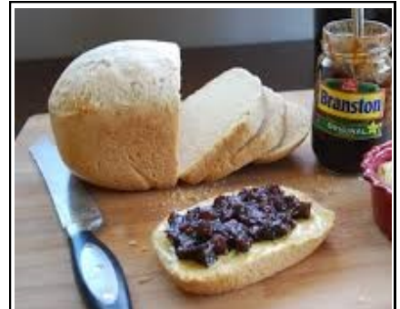
Spread the pickle