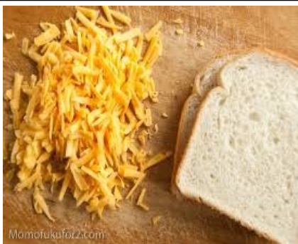
Add the grated cheese to the bread to complete your sandwich.