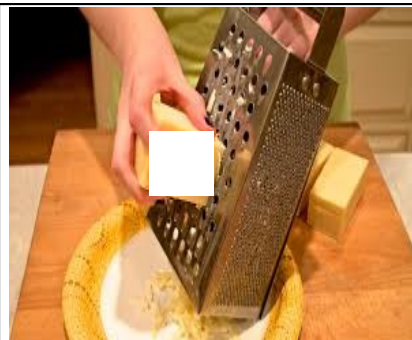
Grate the cheese