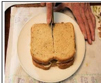
Cut your sandwich in half.