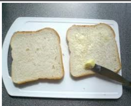
Butter the bread.

1 loaf of bread Butter or margarine A block of cheese 1 jar of pickle